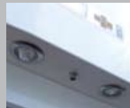
Halogen lights activate when door is opened.