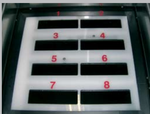
Compartments for blood bags or ampoules for individual freezing.