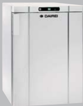
LR 170/LF 140