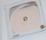
Chart recorder is available (optional).