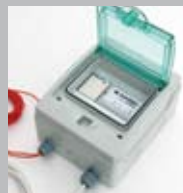
Advanced GSM alarm is available for your extra security (optional).

Perfect craftsmanship signifies the new pharmacy refrigerator in the Dairei range. With the implementation of our already well known multi feature controller and improved cooling performance, the PR360 represent the new generation in pharmacy storage.