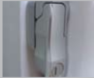
New designed easy to use Door lock.