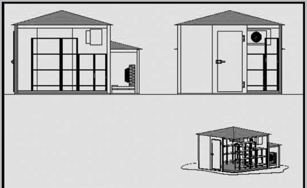
Example 3D drawing