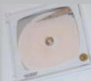
Chart recorder is available (optional).

30 racks and 504 pieces 50mm plastic boxes (optional).