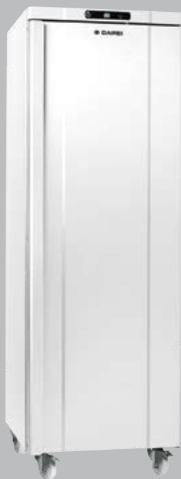
LR 390/LF 340