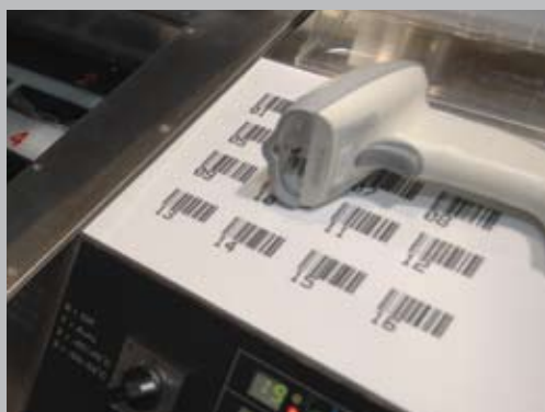
The barcode reader ensures unique logging of the freezing phase of each blood bag/ampoule. It is constructed according to ISP 128.