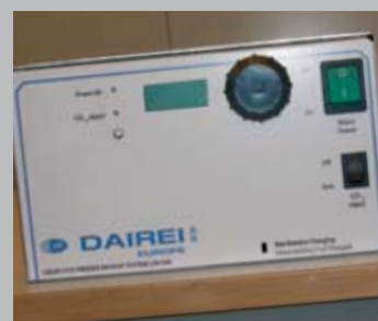
CO 2 back up