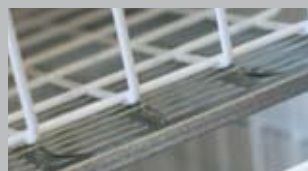
LF 140 comes with direct cooling under each basket.