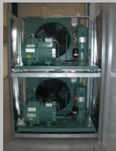
Redundant compressor system for cold store room -25°C