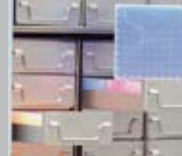
15 racks and 252 pieces 50mm plastic boxes (optional).