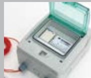
Increase your security. The ULUF series is prepared for GSM alarm.