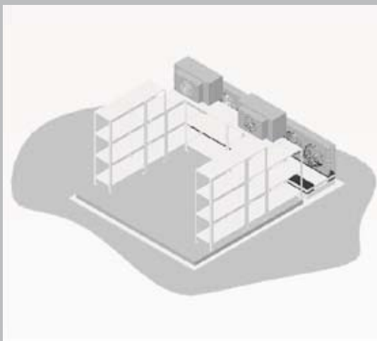
Example 3D drawing

Advanced controller features and digital display. The MDR 2000 can be installed with generator, GPS surveillance and data logger. (optional)