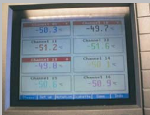
Digital display of data as numeric values or diagram.