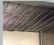
Evaporator freezing shelves provide constant temperature in each compartment.