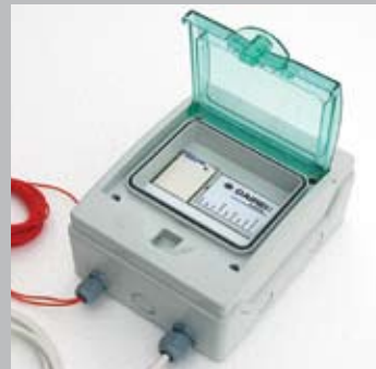
GSM alarm module