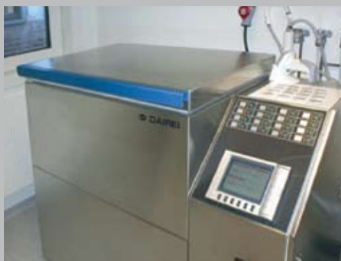
The lid can be opened during freezing process if you need to freeze more blood bags/ampoules.