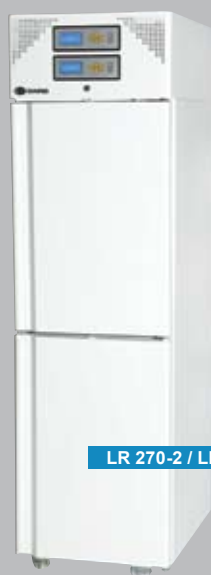
LR 270-2 / LFF 270