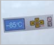
Digital Controller with micro processor and battery backup.