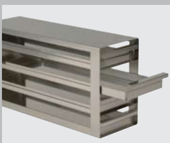
Racks and boxes